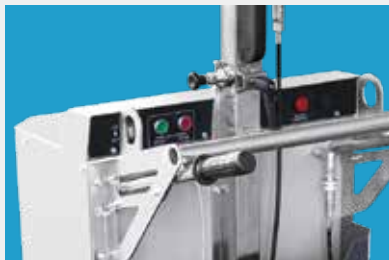
Manual CONTROL PANEL