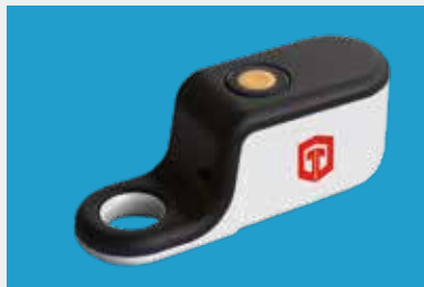
REMOTE CONTROL on / off