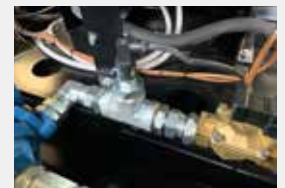
Safety PRESSURE SWITCH