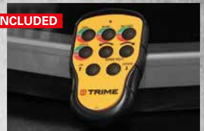
R.O.T. SYSTEM Remote Control 50mt range