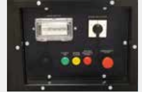
Integrated CONTROL PANEL