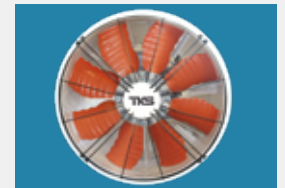
FAN diameter 900mm