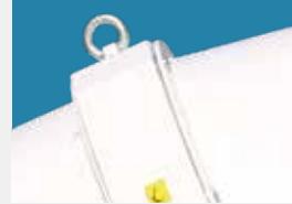
Central LIFTING EYE