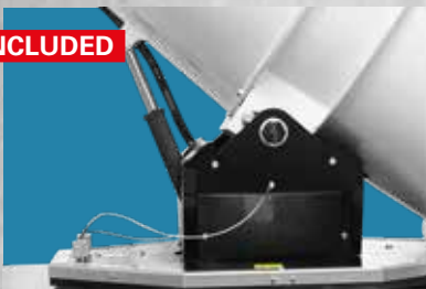
R.O.T. SYSTEM Electric Tilting System