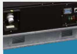
Galvanized SKID BASE with forklift pockets