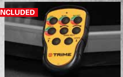
R.O.T. SYSTEM Remote Control 50mt range