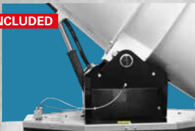
R.O.T. SYSTEM Electric Tilting System