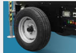
Bigger size WHEELS for off-road sites