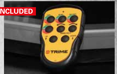
R.O.T. SYSTEM Remote Control 50mt range