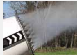
Stainless steel crown with 24 NOZZLES