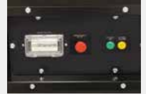
Integrated CONTROL PANEL