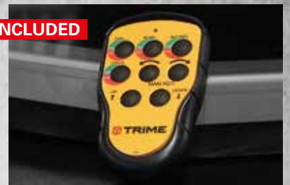
R.O.T. SYSTEM Remote Control 50mt range