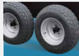
Bigger size WHEELS for off-road sites