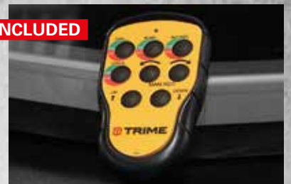
R.O.T. SYSTEM Remote Control 50mt range