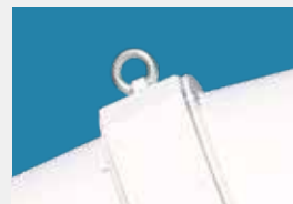
Central LIFTING EYE