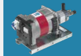
HYDRAULIC GENERATOR included