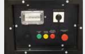
Integrated CONTROL PANEL