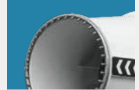
Stainless steel crowns with 72 NOZZLES