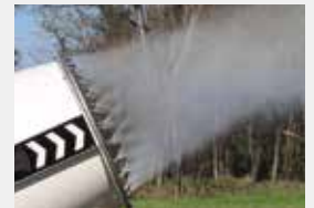
COVERAGE without wind 110-120m